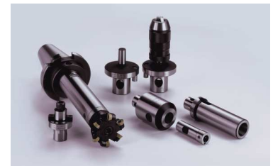
Weldon, morse, milling and drill chucks adaptors