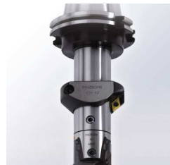
45° chamfering heads